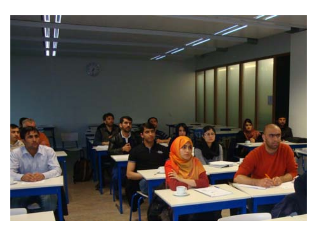
Students attending the evening